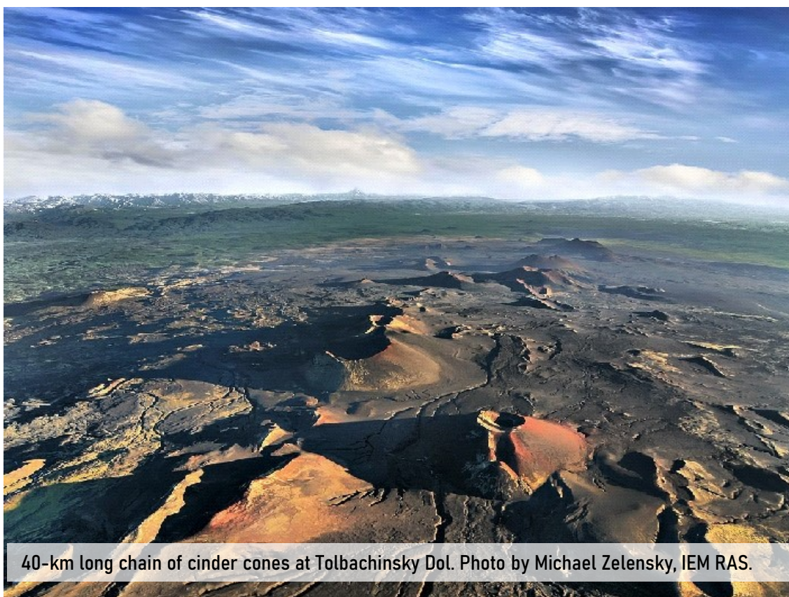
40-km long chain of cinder cones at Tolbachinsky Dol.

Tolbachinsky Dol, 7 days, maximum 22 persons: 650 Euro