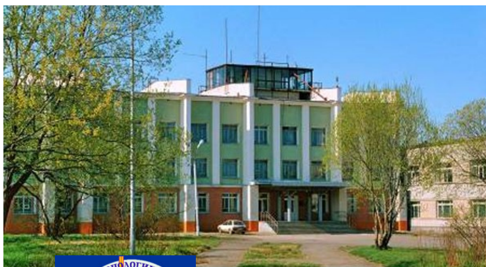
Institute of volcanology and seismology FEB RAS and its logo.

All scientific sessions and posters presentation of the 8IMC will be held at the Conference Hall of the Institute of volcanology and seismology (IVS) FEB RAS, located in Petropavlovsk-Kamchatsky, Kamchatka, Russia.