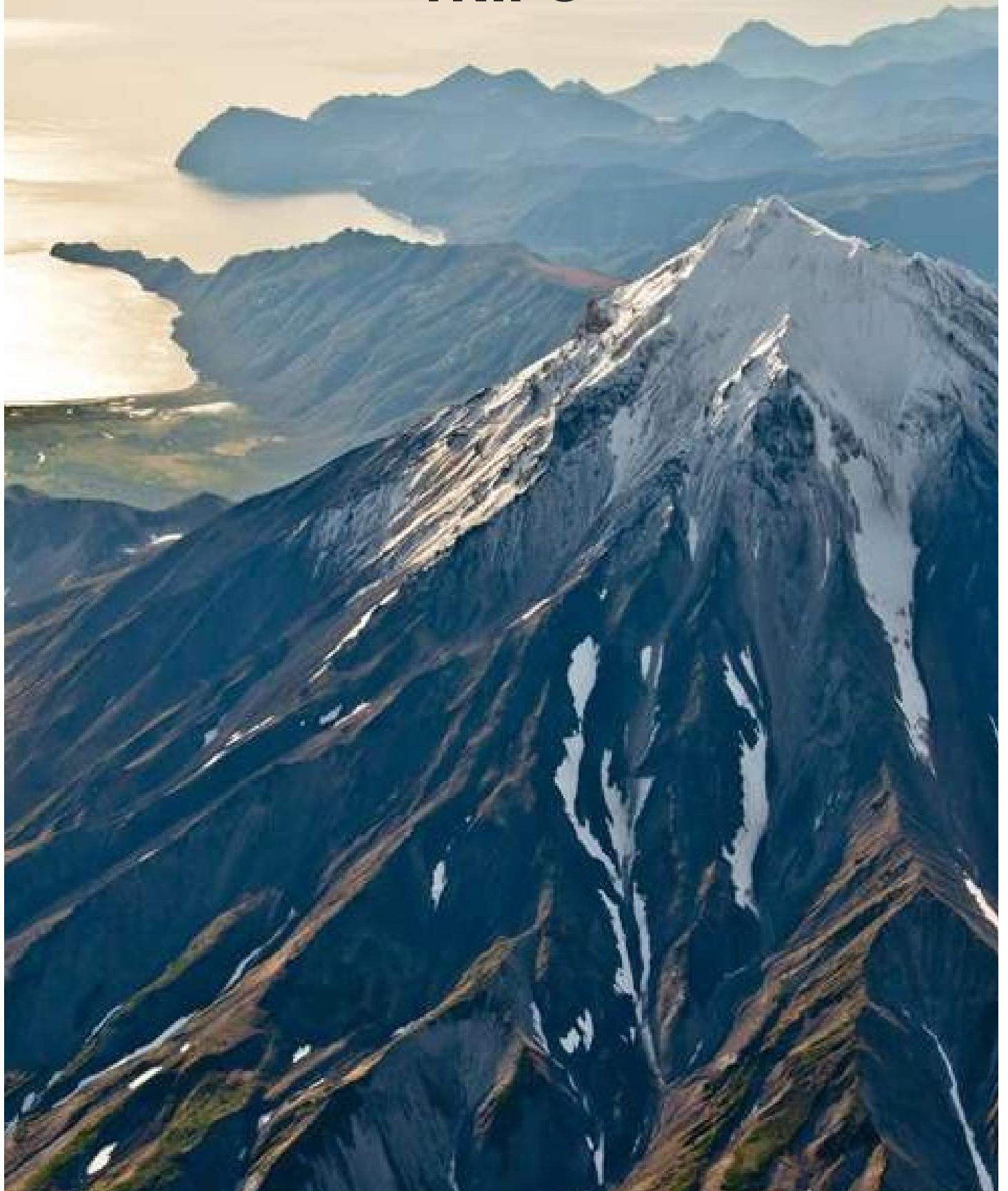
Vilyuchinsky volcano.