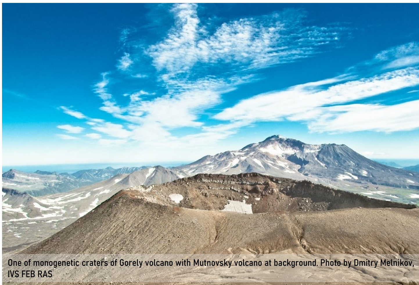
One of monogenetic craters of Gorely volcano with Mutnovsky volcano at background.

For students and PhD candidates it is possible to participate in Mutnovsky volcanological field school, co-organized by University of Alaska, Fairbanks and Institute of volcanology and seismology FEB RAS. The school will be held in Mutnovsky and Gorely volcanoes area (Kamchatka) approximately from August 10 to August 23, 2020. Details can be found at https://www.uaf.edu/geology/academics/international-volcanology and at Facebook page of the school. Application must be submitted directly to the field school organizers. Amount of places is limited, it is important to send application in time.