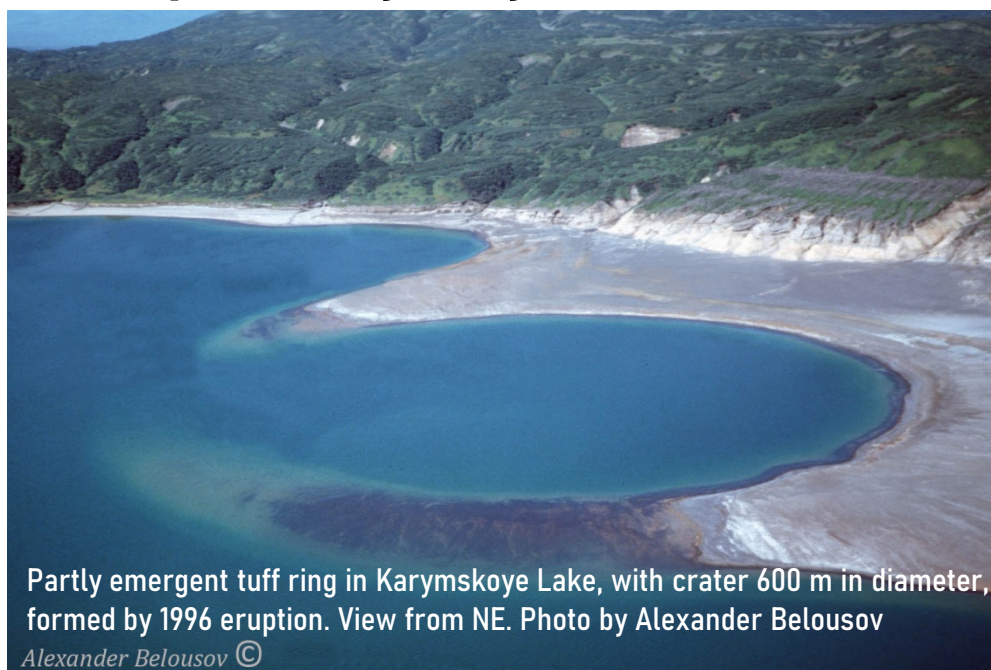
Partly emergent tuff ring in Karymskoye Lake, with crater 600 m in diameter, formed by 1996 eruption. View from NE.